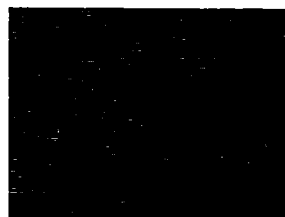
Iridite NCP treated aluminum