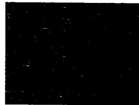
Iridite NCP treated aluminum